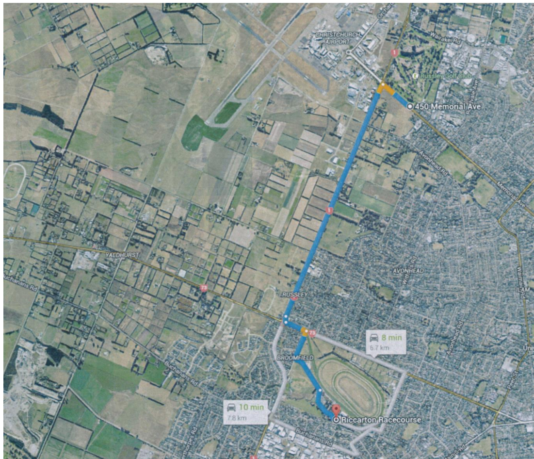
Fig 2: Venue location from Commodore Hotel