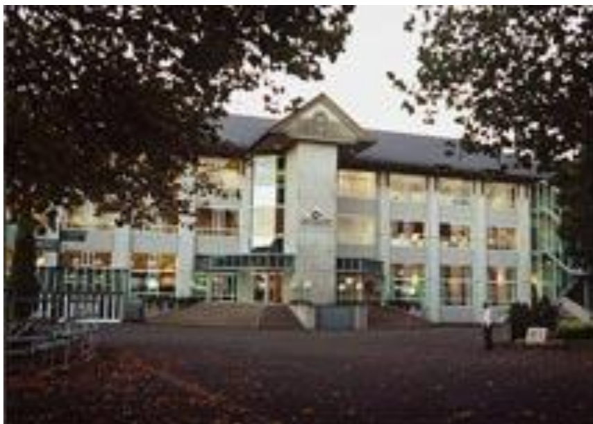
Fig 3: Venue